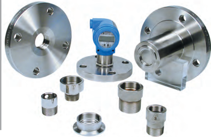
150# Flange Extended Diaphragm - Threaded Nipples/Reducers