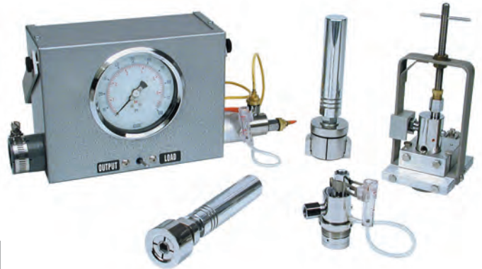
Field Test Panel Welding Mandrel - Field Extractor - Flowmeter

PMC provides industry solutions for the precise and reliable measurement of pressure, level, and vacuum in processes. In 1963, the original flush-mounted transmitter was designed for processes specific to the Pulp and Paper industry. Since then, PMC's patented flush-mounted transmitters have become the standard for accuracy and dependability in industries such as pulp and paper, food and beverage, petrochemical, pharmaceutical, and wastewater management. PMC offers a full line of pneumatic, 4-20mA, Hart® protocol, and submersible instrumentation with accessories that are built to last. Rugged and reliable , PMC products accurately measure corrosive, viscous, and clogging fluids in industrial applications around the world.