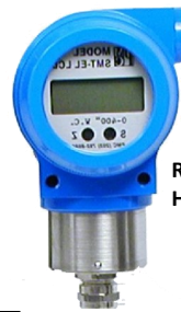
Remote Terminal Head and Display